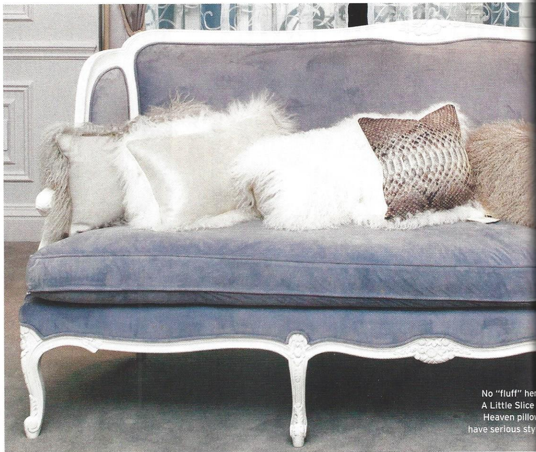
No "fluff" here: A Little Slice of Heaven pillows have serious style.

Holly Jaffe launched WOWHAUS in 2013 with the aim to make elite pillows that would juxtapose textures and materials in residential interiors. "WOWHAUS is all about producing limited-edition and true custom collections for homeowners, hoteliers, and others who want nothing less than real exclusivity and [peak]-of-luxury experience," says Jaffe. Her A Little Slice of Heaven® line includes pillows that feature French milled calfskin, Italian suede, natural matte python, and Spanish nubuck, among others. The crème de la crème of the collection is a limited edition, hand-antiqued "rattlesnaked" leather and Tibetan lamb fur accented pillow. If you're looking for something to set your home apart, these pillows are it. Available at taigan.com , and Katie Fong Boutique, 60 Lewis St., Greenwich, 203-717-1660, wowhaus.com . -DH